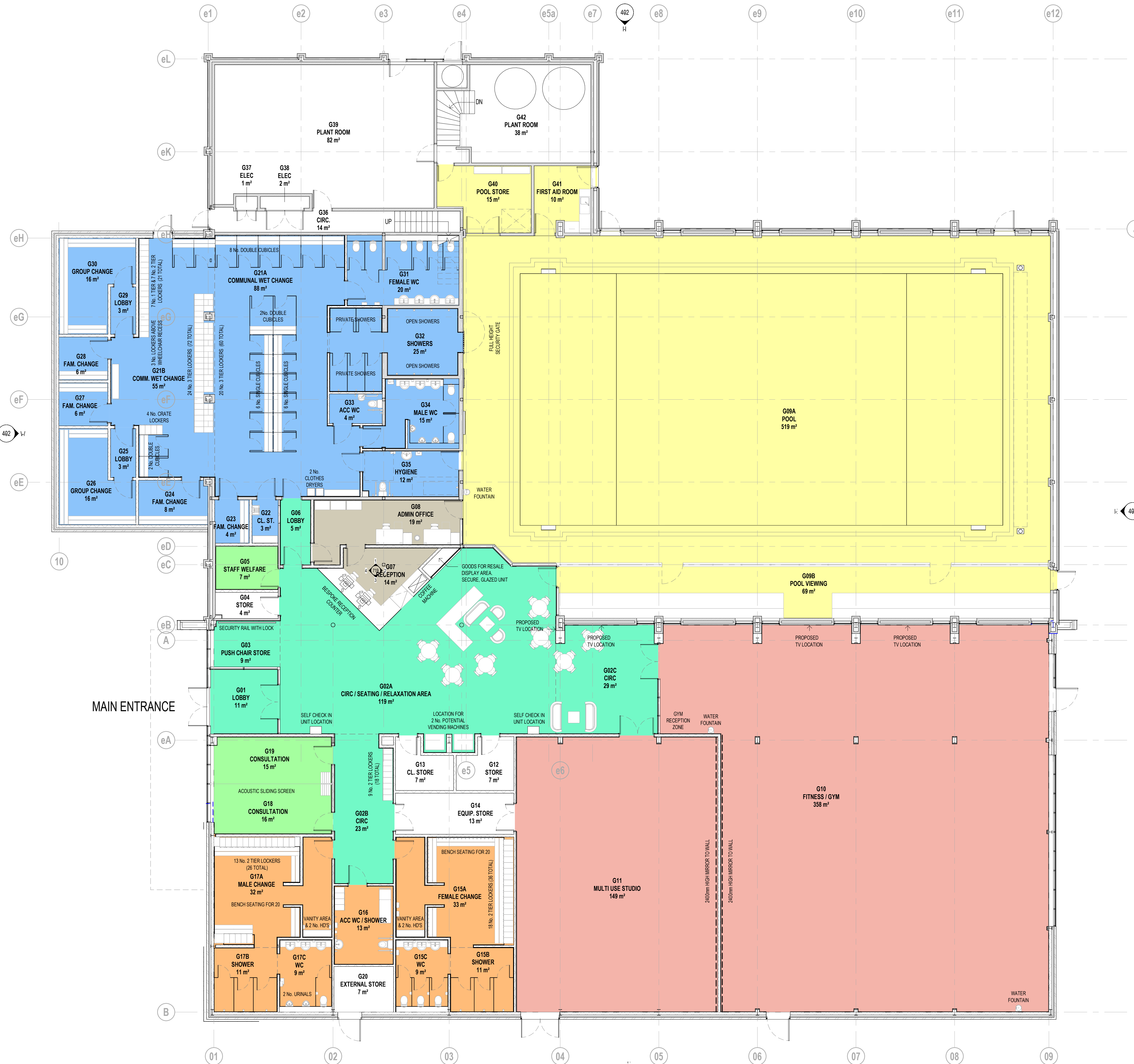
PROPOSED GROUND FLOOR PLAN 1:100